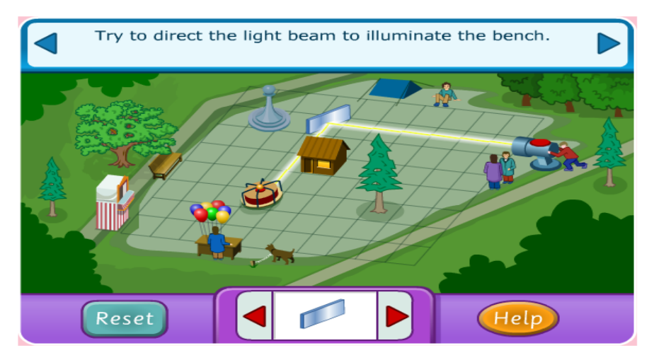
Figure 1. The Screenshot from the Game of "How We See Things?"

bottom of the game screen. Students, who discover that the light can change the way by the mirror, try to illuminate the objects on the screen in the next stage. The first tasks begin with directing the light by using a single mirror. Upon successful completion of this stage, students are asked to illuminate objects that require a more complex mechanism with the help of mirrors. The game is complete when all objects on the game screen are highlighted. At the end of the game, a discussion was done in the class to realize what the students learned.