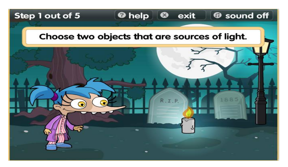
Figure 2. The Screenshot from the Game of "Spooky Mansion"

The second game "spooky mansion" is about how to classify the light sources. The game consists of three difficulty levels. The game was started by selecting the most difficult level which was found to be more appropriate for the age of the students. During the game, students must provide the correct answers to escape from a mansion. There are three light sources in each scene and students are asked to choose the natural light source(s). Figure 2 shows a screenshot of the game. The game consists of five stages. The student who gives the wrong answer starts the game from the beginning and tries to find the right answers. Bonus stages are opened for the student who has completed the five stages of the game correctly. In this part of the game, the shadow reflected on the wall is asked to find out what the object is. This part of the game is related to the objective 'students will be able to predict when light encounters the matter.'