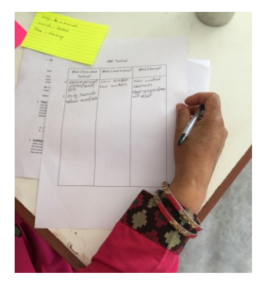
Figure 3. A Block B Teacher Works on Filling out her KWL Chart during the PD

culture, farming practices, brick manufacturing, etc.), leveraging their prior knowledge as funds of knowledge would aid in adjusting pedagogy and uses of technology to make learning more culturally relevant to students. In this approach we engaged teachers in a simple tool called KWL-chart [What you Know (K)?; What you Want to know (W)?; and What you Learned (L)?] (see Figure 3). At the beginning of the workshop we asked teachers questions like, "What do you already know about integrating technology? About teaching?" "What value do you find in integrating technology in your teaching?" to find out what they knew/believed. This was followed by "What they wanted to know about technology integration and teaching in the workshop?" After the engagement in pedagogical strategies or technology integration activity, we would ask the teachers, "What did you learn about from that activity?" This modeling allowed teachers to practice and build skills to use KWL-chart in their class as a pedagogical tool and informed our understanding of their needs/wants.