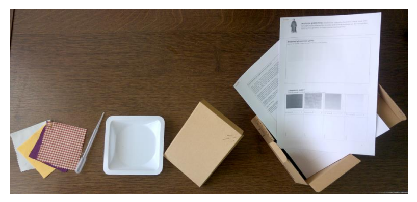
Figure 1. Activity Kit and the Sample Fabrics

In the activity named "Can Nanotechnology Keep Us Dry in the Rain", it is aimed that the students determine the most suitable and useful fabric for raincoat production among the sample fabrics offered to them by conducting an authentic inquiry. For this aim, teacher give students a task in which they are in charge of selecting textiles at a factory and must selecting the right fabric. To do so, teacher ask them to observe and touch a different set of fabrics and express their starting ideas based on their existing ideas and previous experiences (see figure 1).